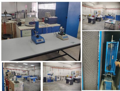
Highway and Geotechnical Laboratory