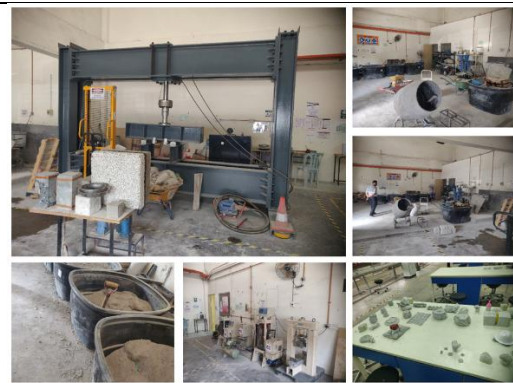
Cement and Concrete Laboratory