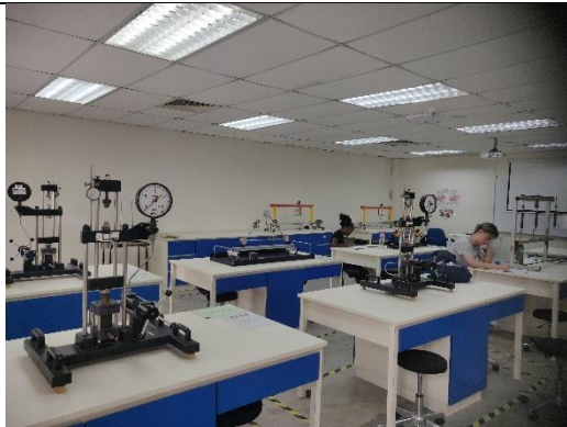
Solid Mechanics Laboratory