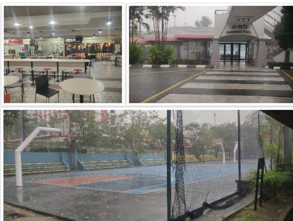
Sports, Stationary & Mart Amenities in Campus