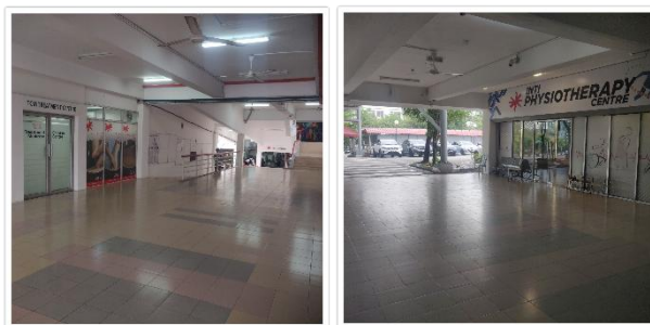
Medical and Health Center in Campus