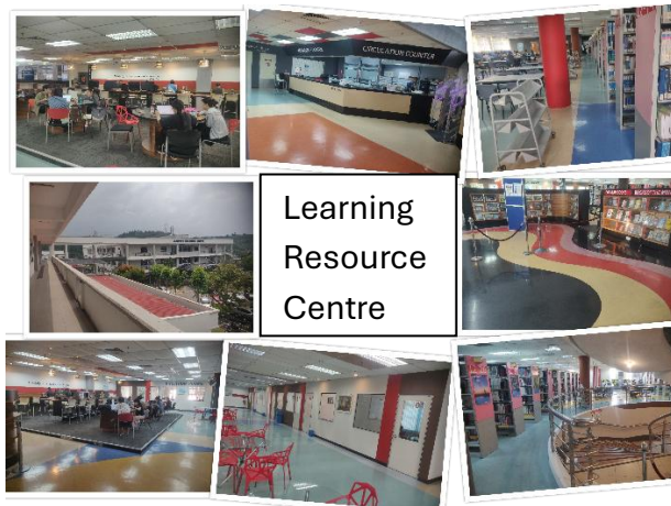
Learning Resource Center