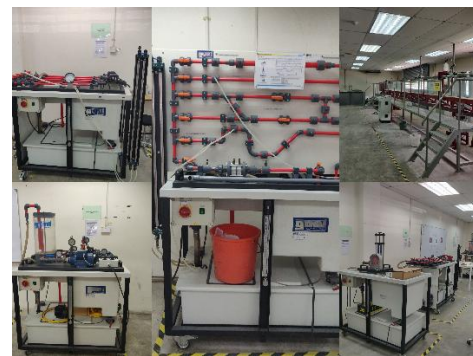
Fluid Mechanics Laboratory