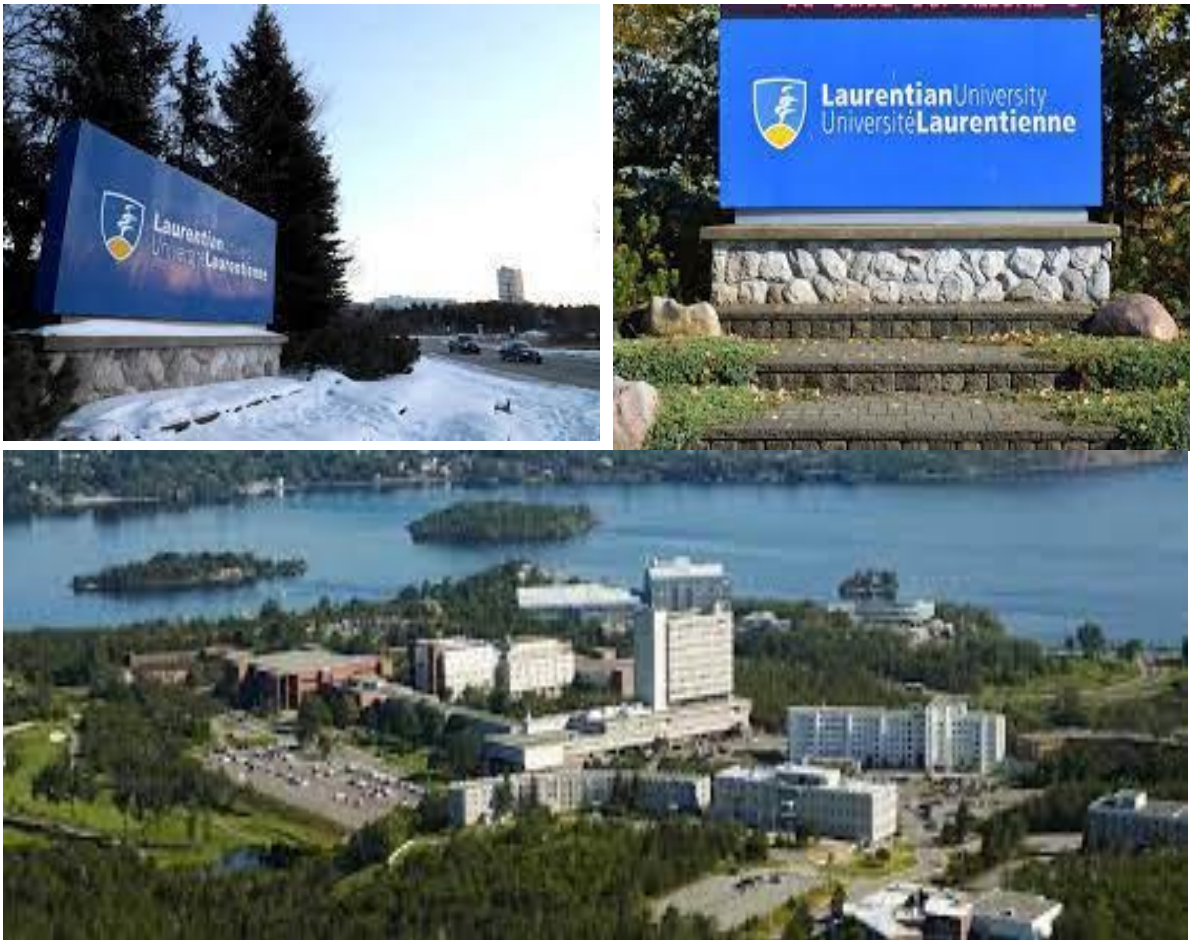
Laurentian University Campus View