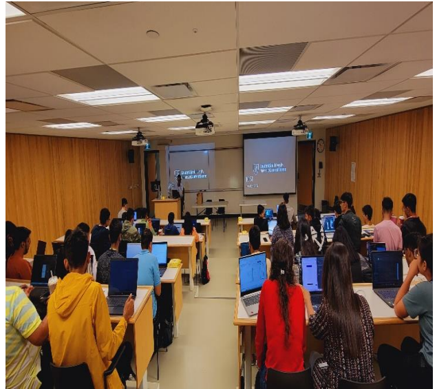
02. LU Classroom-01