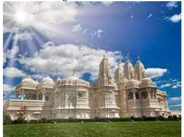
BAPS Swaminarayan Mandir Toronto