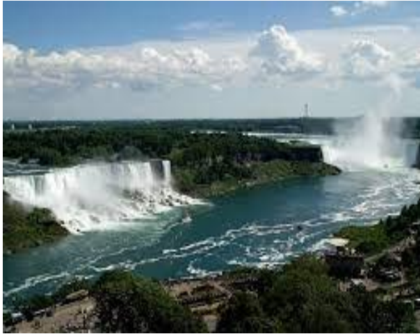
Niagra Waterfall View