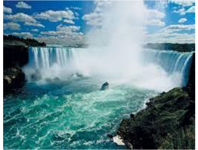
Niagra Waterfall View