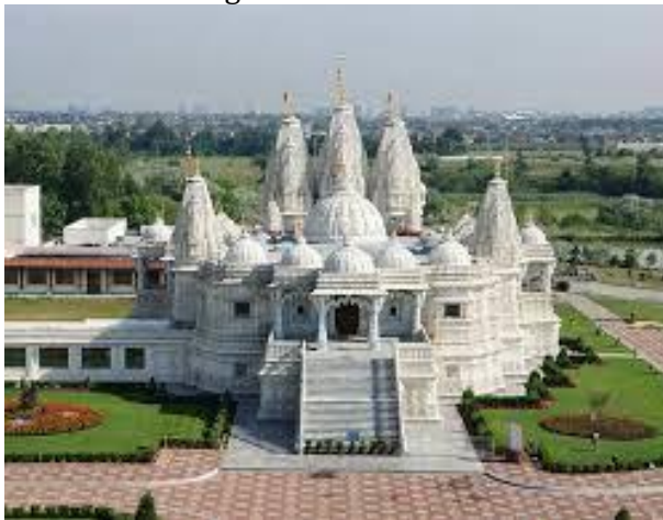
BAPS Swaminarayan Mandir Toronto