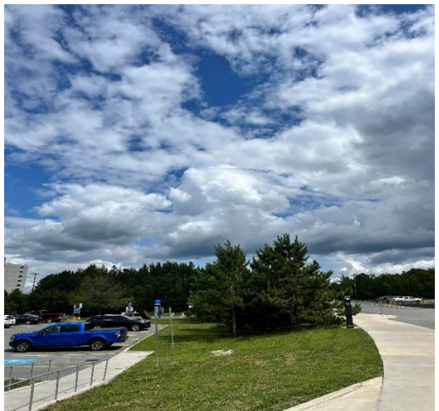
04. LU Campus