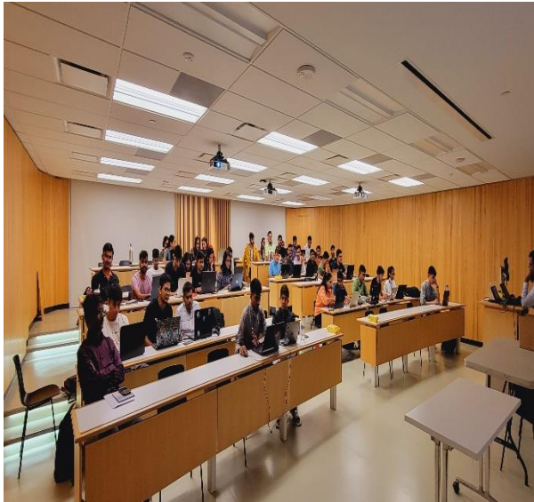
01. LU Classroom-01